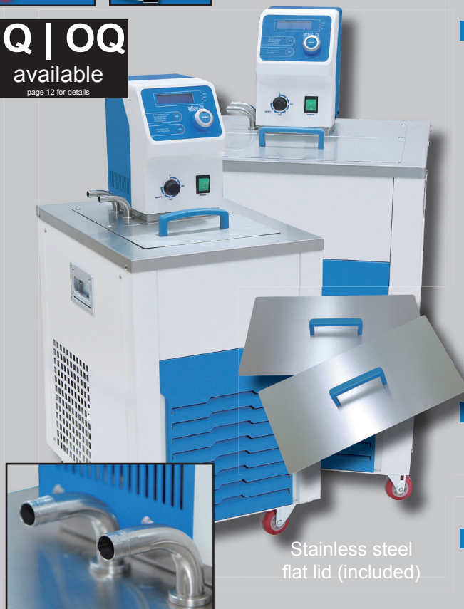
Stainless steel flat lid (included)